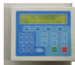
Machine Control Console