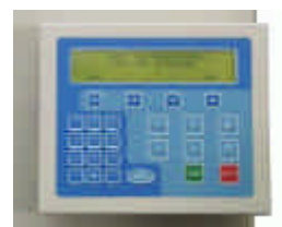
Machine Control Console