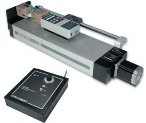
The ESMH is shown in a peel testing application, with Series BG digital force gauge, digital travel display, and pneumatic film & paper grips