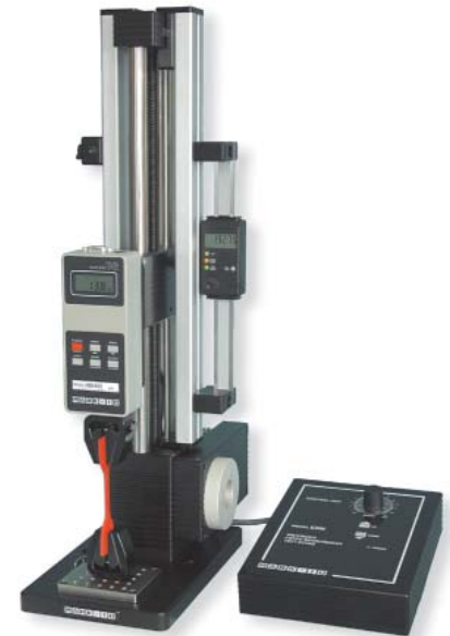
The ESM is shown in a typical tensile testing application, with Series BG digital force gauge, digital travel display, limit switch kit, and wedge grips