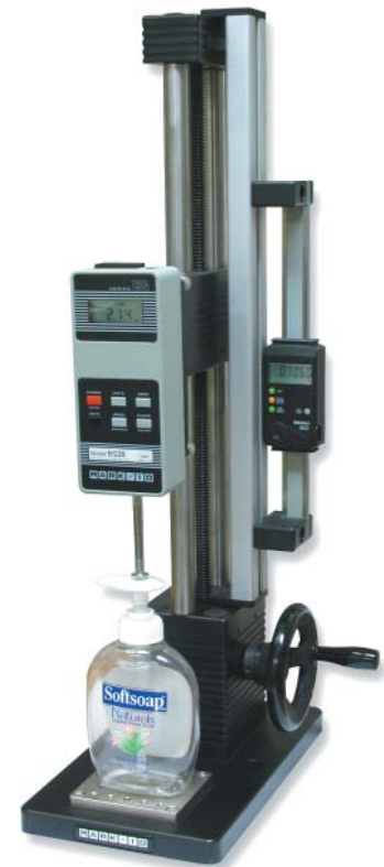
The ES30 is shown in a typical compression testing application, with Series EG digital force gauge, digital travel display, and attachments