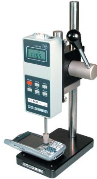
The ES05 is shown in a switch contact activation test, with Series BG digital force gauge, extension rod and rubber tip attachment.