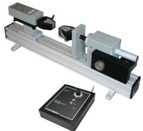
The TSFM500H is shown set up for a tensile test, with Series CG digital force gauge and wedge grips.