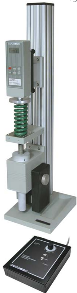
The TSFM500 is shown in a typical spring testing application, with Series CG digital force gauge and compression plate.