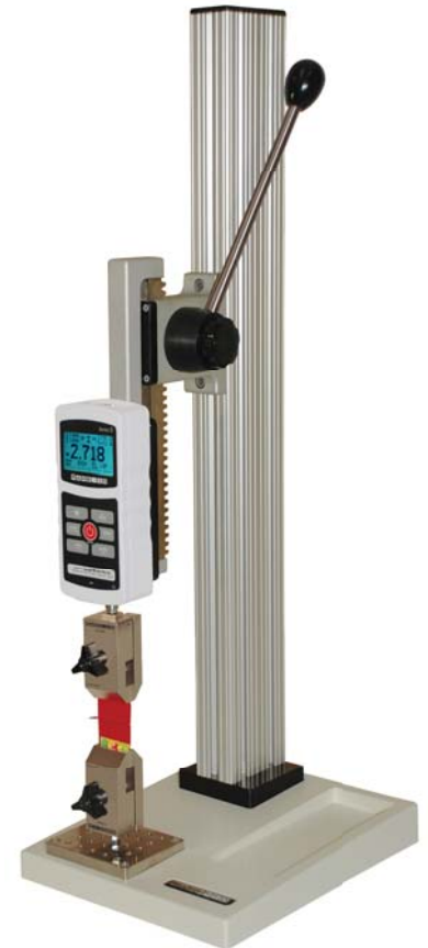
The TSB100 is shown with a Series 5 force gauge