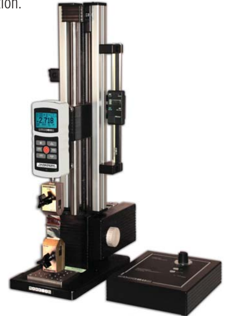
The ESM is shown in a typical tensile testing application, with Series 5 digital force gauge, digital travel display, limit switch kit, and wedge grips