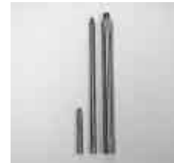
SPK-FMG-013A 100 lbf 10-32F available as 1", 2", 5" & 6" SPK-FMG-013B 500 lbf 5/16-18F only available as 6"