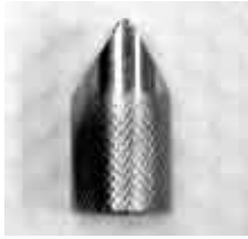
SPK-FMG-008A 100 lbf 10-32F SPK-FMG-008B 500 lbf 5/16-18F