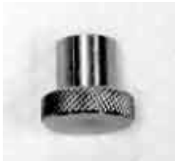
SPK-FMG-011A 100 lbf 10-32F SPK-FMG-011B 500 lbf 5/16-18F