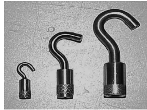
SPK-FMG-012A 50 lbf 10-32F SPK-FMG-012B 100 lbf 10-32F SPK-FMG-012C 500 lbf 5/16-18F