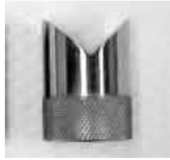
SPK-FMG-010A 100 lbf 10-32F SPK-FMG-010B 500 lbf 5/16-18F